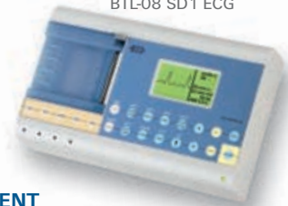
BTL-08 SD1 ECG