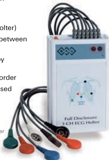
BTL-08 3-channel ECG Holler