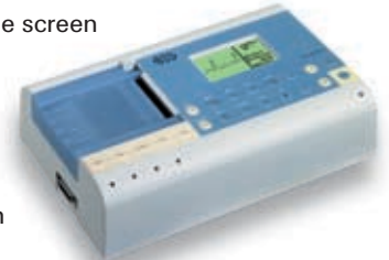
BTL-08 SD3/SD6 ECG