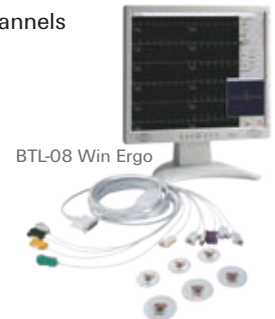
BTL-08 Win Ergo