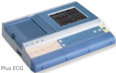
BTL-08 MT Plus ECG