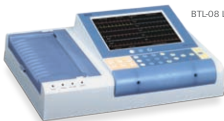
BTL-08 LC/LC Plus ECG