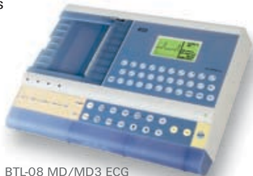
BTL-08 MD/MD3 ECG