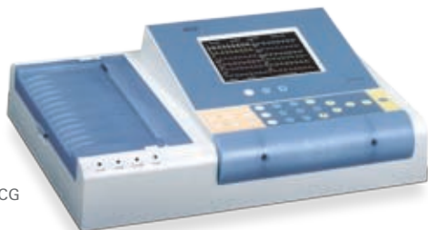
BTL-08 LT/LT Plus ECG